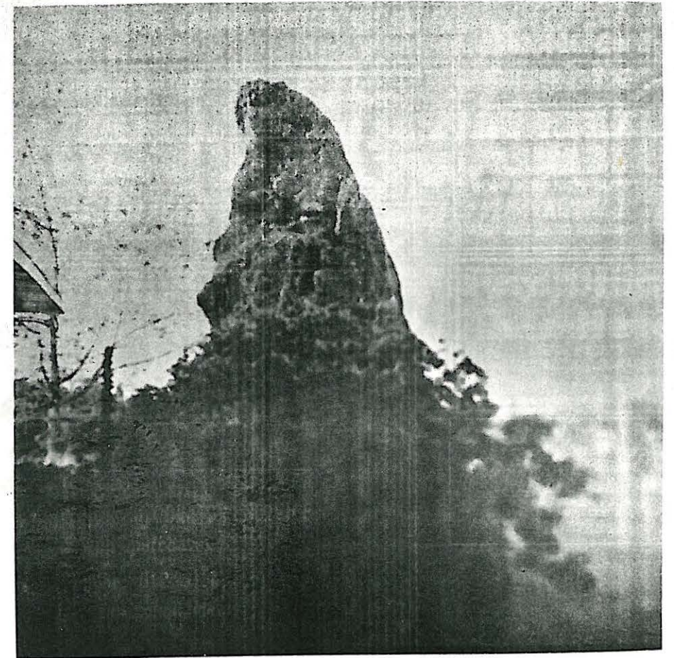
VICTORIA ROCK on Victoria Road

PRICE FIVE CENTS VOLUME 4, NUMBER 9, Page 1